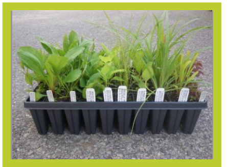
Thank you Cardno JFNew for the native plants for our <u>native plant sale</u>! Check out our website for more details.