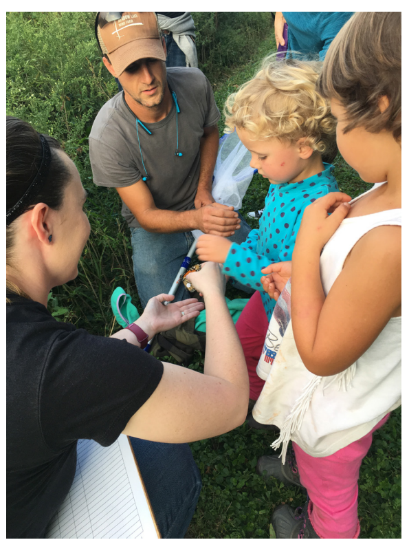
Tagging and releasing monarch butterflies on the Urban Wilderness Trail