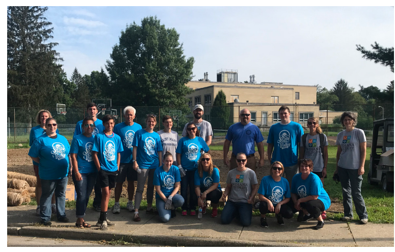
A Photo: IWF, United Way, and Saint Mary-of-the-Woods volunteers

We spent a beautiful July 27th morning at Saint Mary-of-the-Woods College working along the newly certified Lake Le Fer Trail with St Mary alumns and United Way volunteers! With the invasive species gone, the banks of the lake need to be stabilized to prevent erosion. We started by spreading native seeds along the bare spaces on the bank. We mix fast-growing annual grasses with perennial flowers to provide immediate and longterm stability. Those plants will also enhance and create current habitat on the lake.