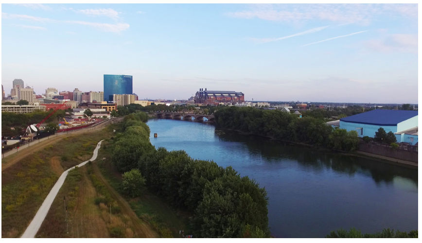
A Photo: Urban Wilderness Trail from the sky

The Urban Wilderness Trail (UWT) is expanding its wildlife habitat! The UWT has plans to add an additional native planting, titled Stairs to the White River, near the New York Street bridge in downtown Indianapolis. The planting will consist of a mix of sedges, grasses, and wildflowers that will tolerate seasonal saturation, as well as drier conditions during summer and fall. Once established, the plants will enhance the already habitat-rich river corridor by attracting more pollinators and other wildlife to the area. This amazing addition was made possible by Reconnecting to our Waterways (ROW) and the Nina Mason Pulliam Charitable Trust (NMPCT). Be on the lookout for potential volunteer opportunities this fall!