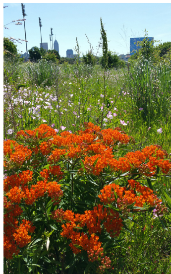
Butterfly weed flourishes on the Urban Wilderness Trail.