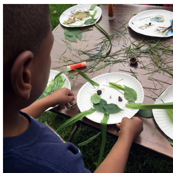
People in the Environment (PIE) Day at Cold Spring School in May! We took a nature walk and made "nature faces"!