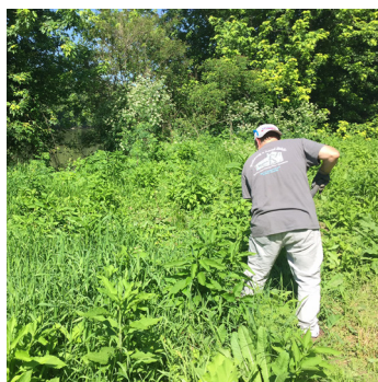
Volunteers planted 100 trees along the Urban Wilderness Trail at White River.