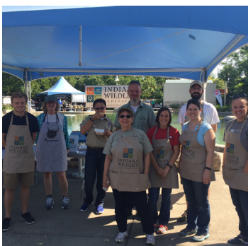
Our incredible volunteers for this year's Taste of the Wild cookout hosted by the DNR at the Indiana State Fair.