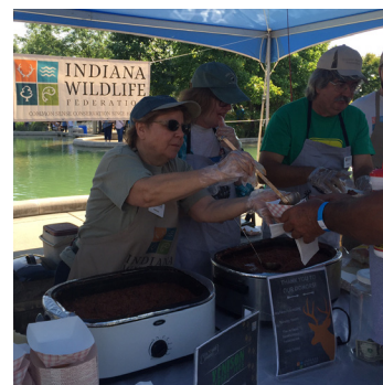
Volunteers served about 800 venison sloppy joes to Indiana State Fair guests!