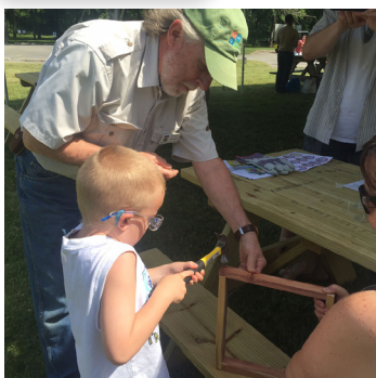
Volunteers built over 120 bird feeders with guests at the Hoosier Outdoor Experience.