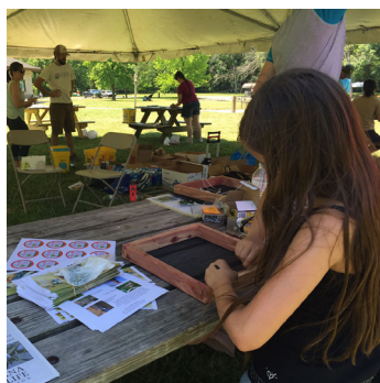
Bird feeder building at the Hoosier Outdoor Experience was a hit!