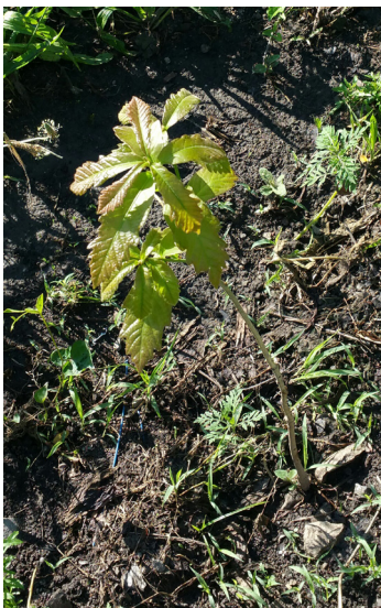
One of the Swamp White Oak Trees planted by volunteers after one month of growth.