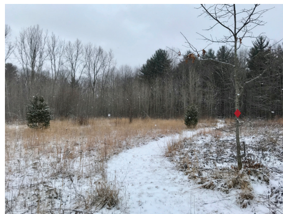
▲ Photo: Tryon trail in the winter

Native Plant Installation-Tryon Farm - TBA