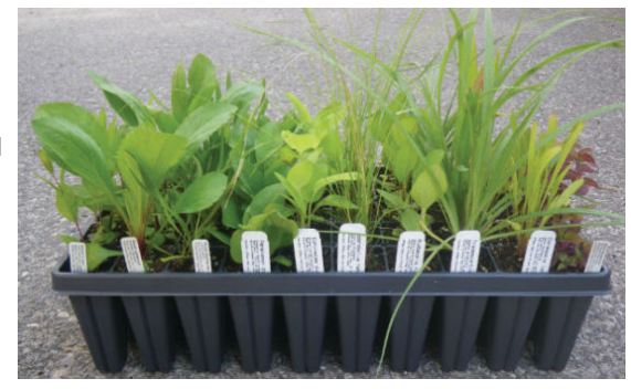
A Photo: Pollinator Kit

Thanks to our partnership with Cardno Native Plant Nursery to provide a selection of native plant kits, bare root shrubs and trees, and seed packets. Each plant kit contains 50 native plants that will be delivered to your door. Every purchase supports IWF and Indiana's wildlife.