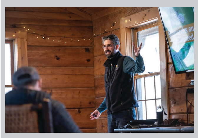
A Photo; presenting to Teter Retreat and Organic Farm

Do you belong to or manage a group looking for educational workshops? IWF offers several presentations from our Wildlife Habitat Workshop, which covers the basics of creating habitat at home to our Indiana's Wild Climate Workshop where we discuss the impact of the climate crisis on Indiana and our wildlife. If you would like more information or want to schedule a workshop, please visit our Workshops Page or contact Aaron Stump at stump@indianawildlife.org.