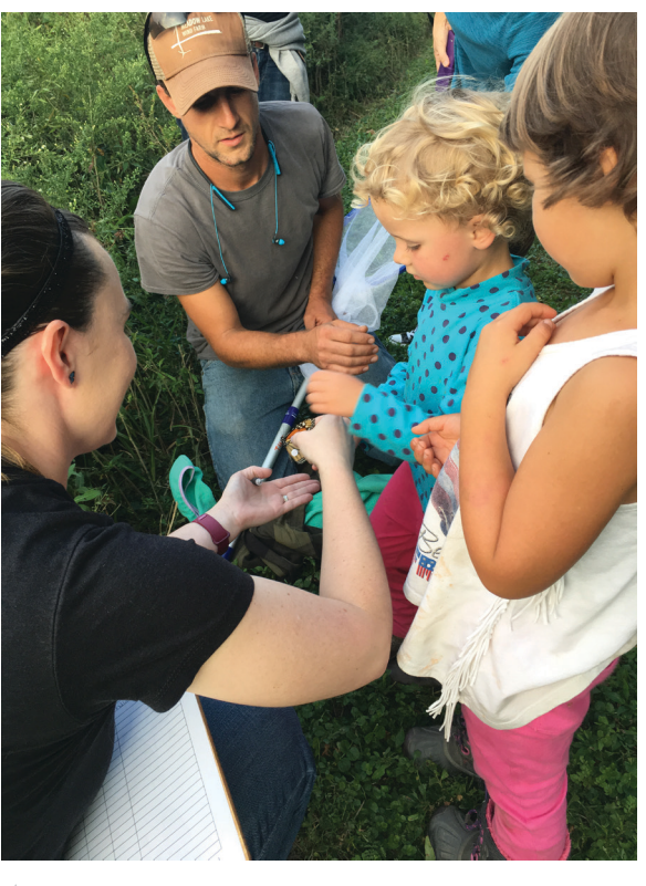
Tagging and releasing monarch butterflies on the Urban Wilderness Trail