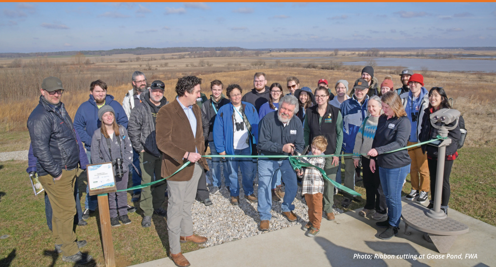
Photo: Ribbon cutting at Goose Pond, FWA